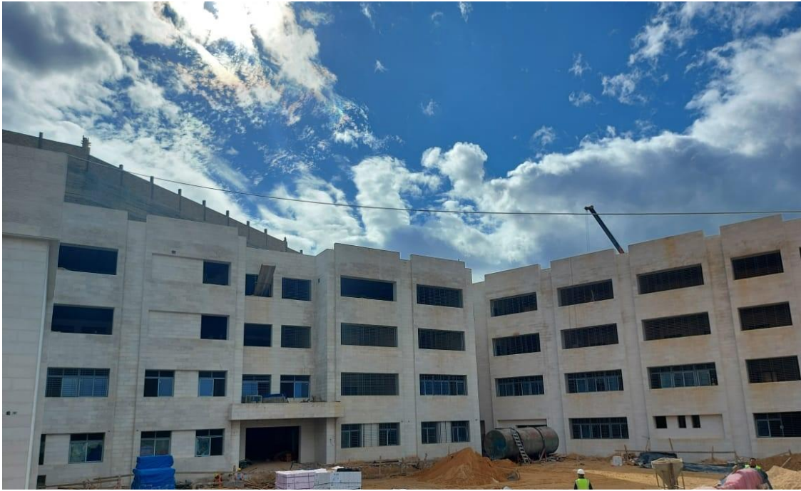
General view of the project site