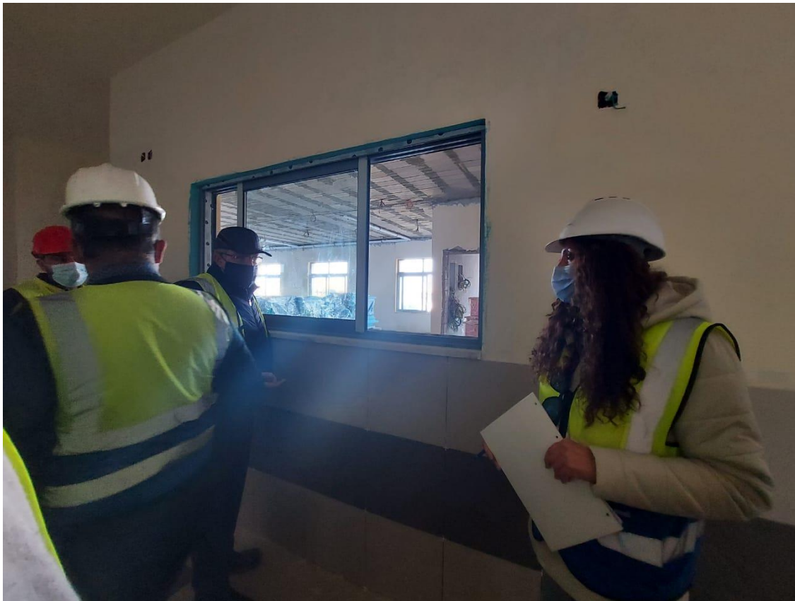
(Figure: 18 & 19)

The team inspected the aluminum windows under installation and stressed that the window jambs should be well finished and inspected by the supervision site team before installation of aluminum frames