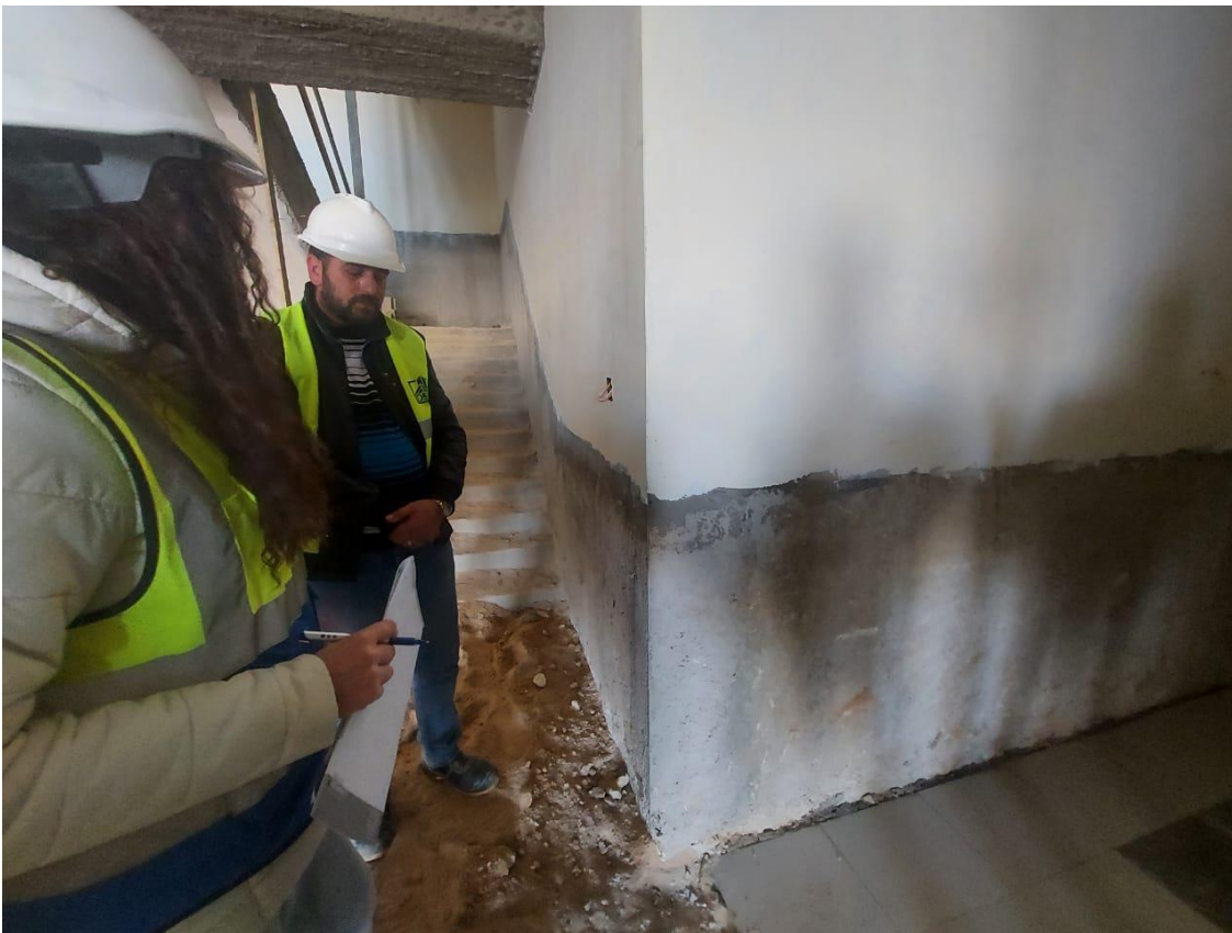
The team discussed with the Contractor the connection between porcelain wall cladding at the corridors with the granite cladding at staircases