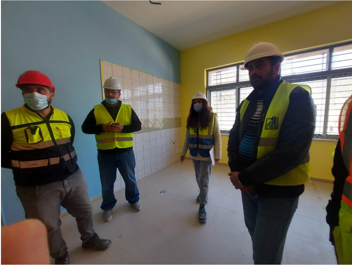
The execution of KG mock-up