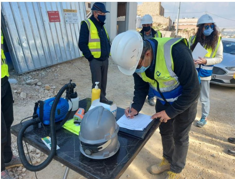
Sterilization and signing visitors' attendance sheet at the entrance of the site, complying with Covid-19 Protocol