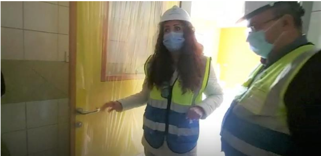
(Figure: 22 & 23)

The team inspected the prepared wooden door sample and requested the Contractor to modify the location of the door lock and handle not to merge into the beech wood door frame