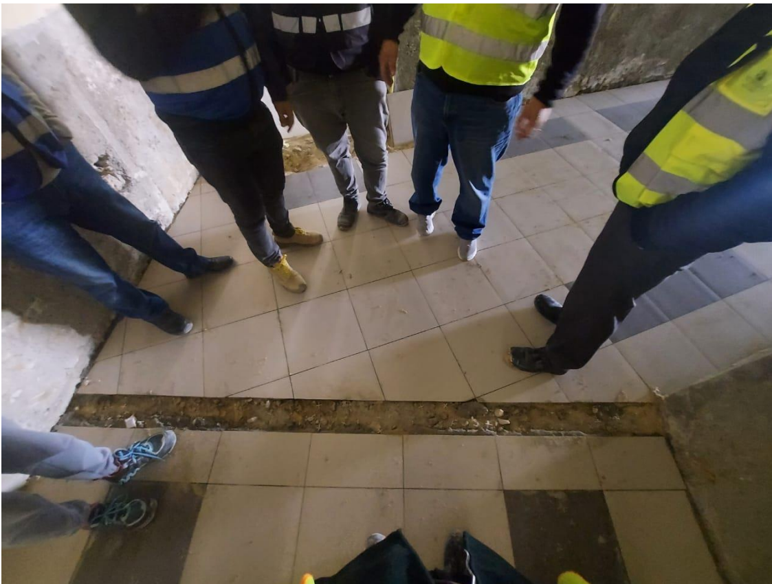
(Figure: 11 & 12)

The team discussed with the Contractor the connection of floor porcelain tiles of two corridors