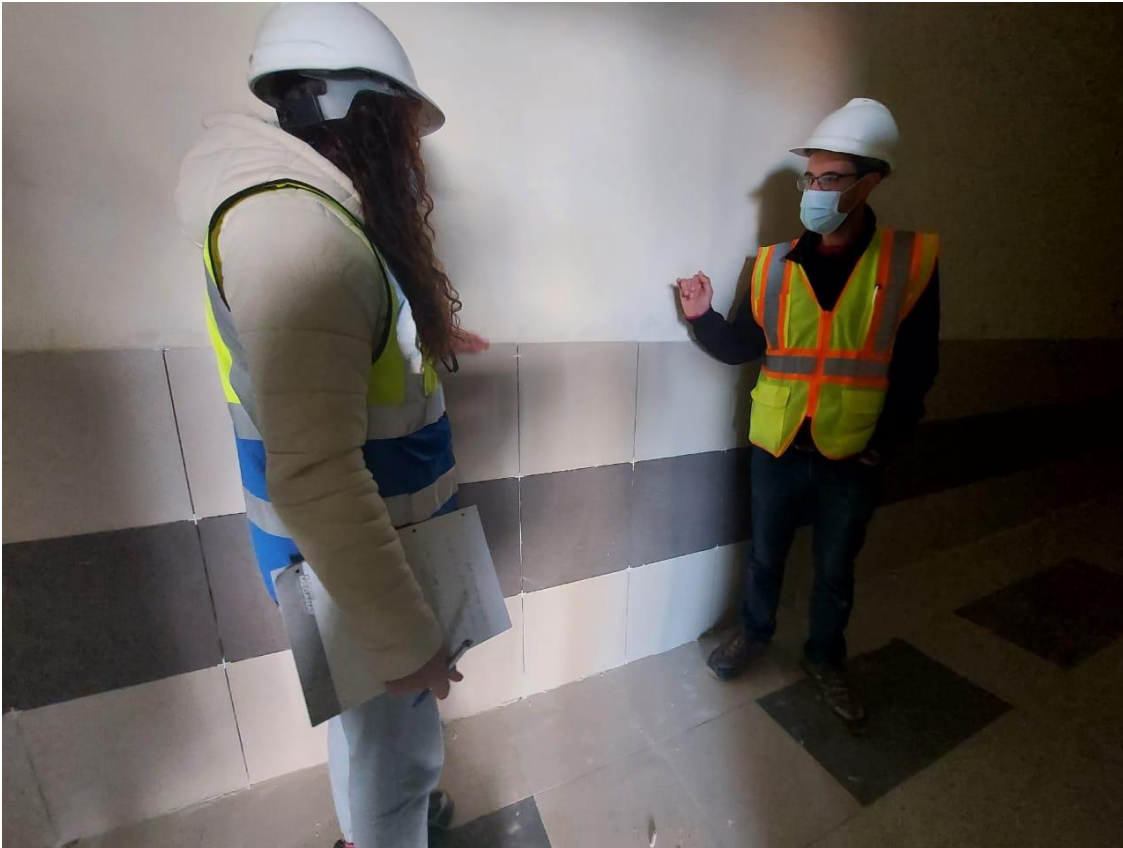
Inspecting the execution of wall tiling for the corridors