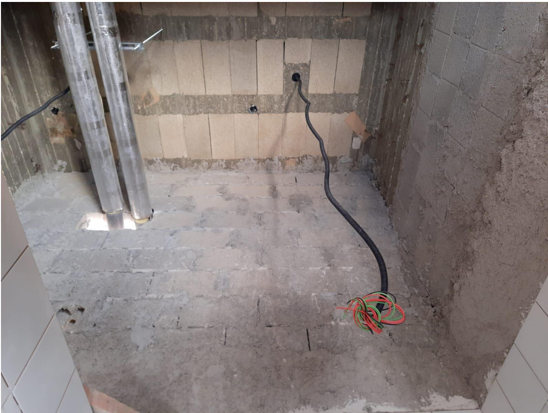
(Figure: 13 & 14)

The team inspected the built block above false ceiling at the wet area in the multi-purpose hall and stressed on the Contractor to fill all gaps between blocks before installing the suspended ceiling