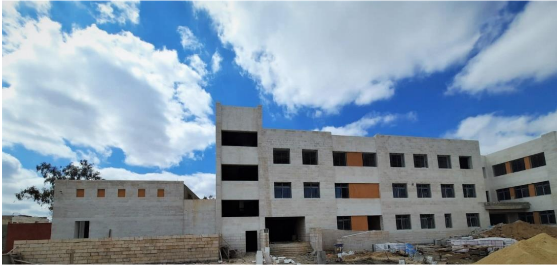
General view of the project site (figures: 01, 02, 03 & 04)