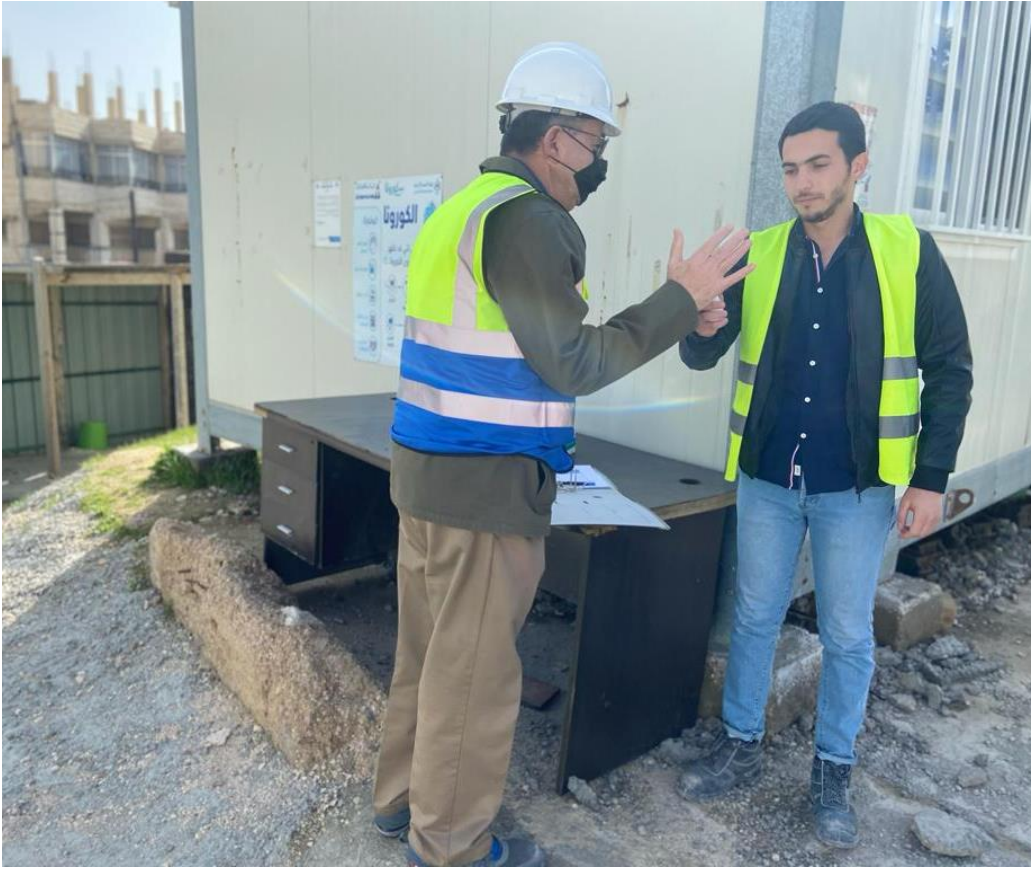
Sterilization and signing visitors' attendance sheet at the entrance of the site, complying with Covid-19 Protocol