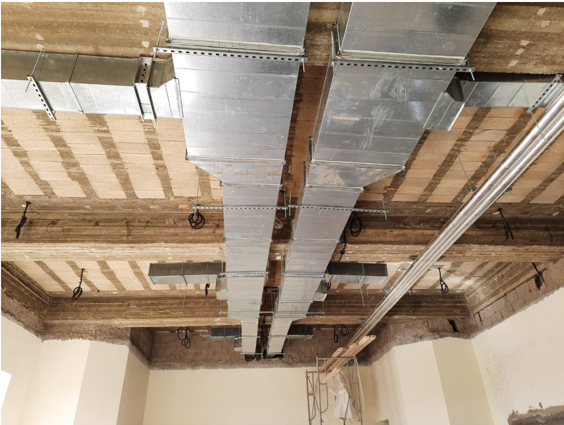
(Figure: 17 & 18)

The team inspected the electro-mechanical installation work under the ceilings