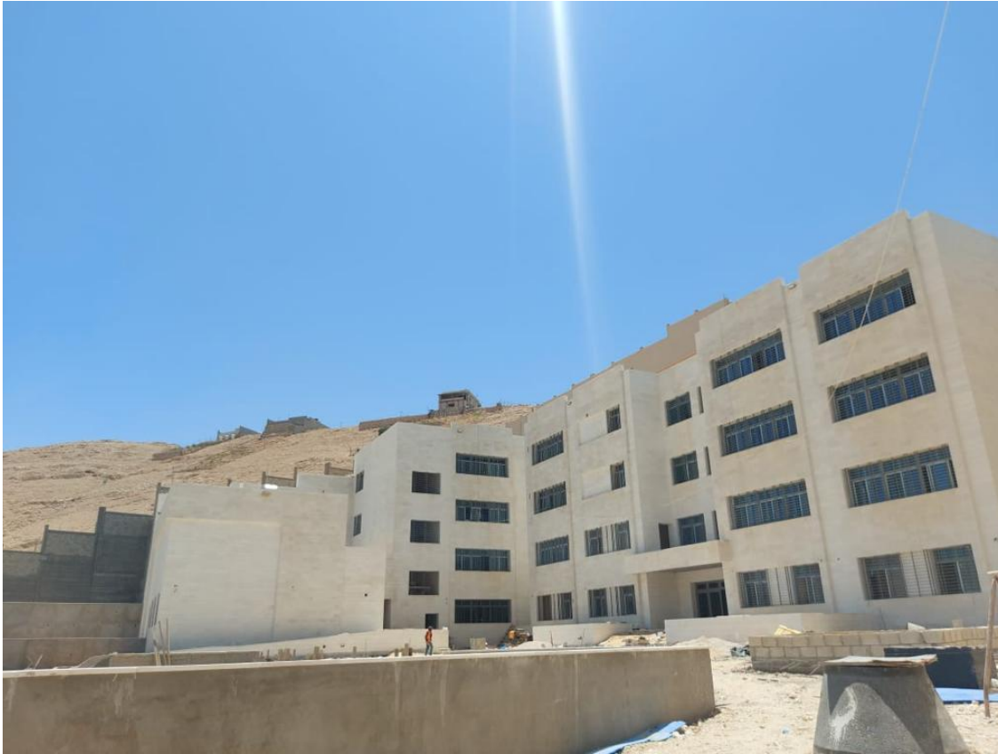
General view of the project site