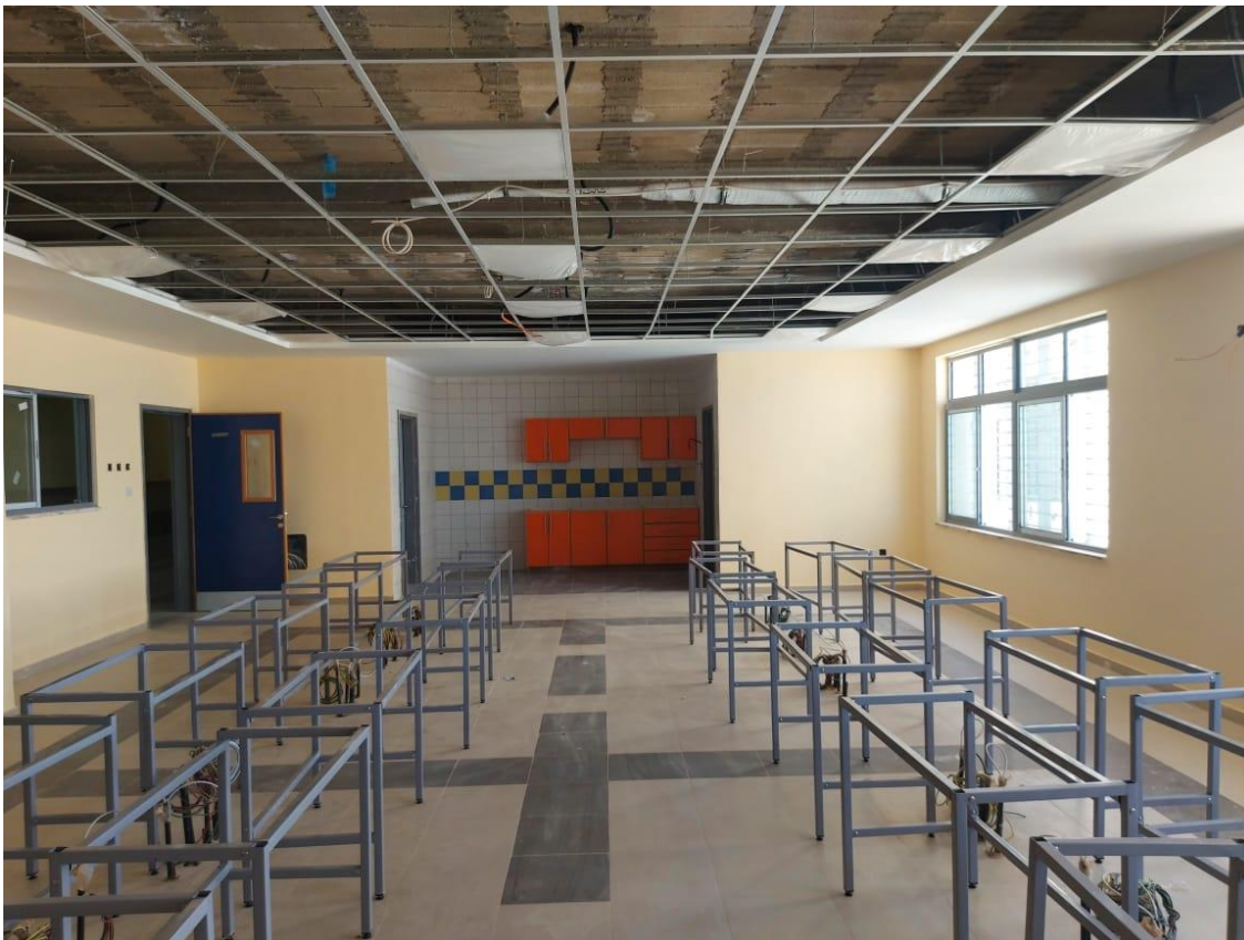
(Figure: 13 & 14)

The team inspected the progress of work at the multi-purpose hall