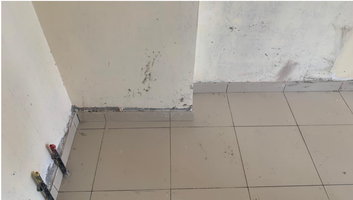
Unacceptable small cut-off tile pieces