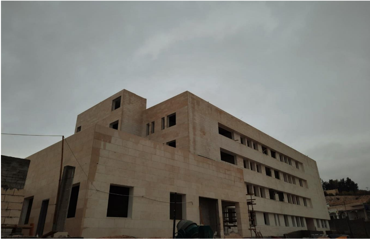
General view of the project (Figure: 01, 02 & 03)