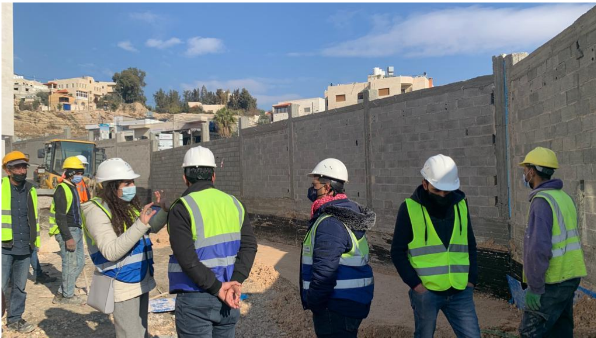
The excavation for the canopy foundation has been inspected