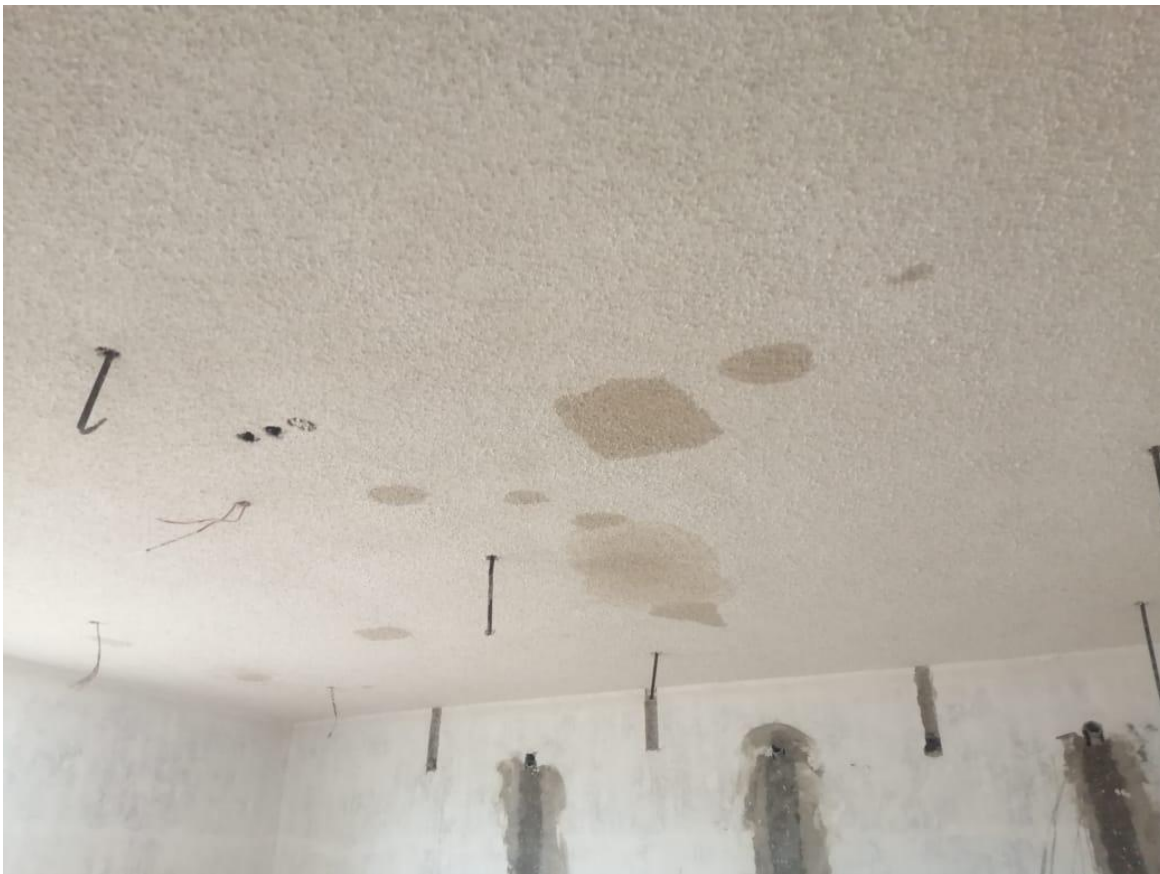
(Figure: 19 & 20)

It was observed that rain water penetrated the building due to defects in the roof waterproofing and, as a result, defects have been observed in the finishing work inside the building. The Contractor was requested to rectify