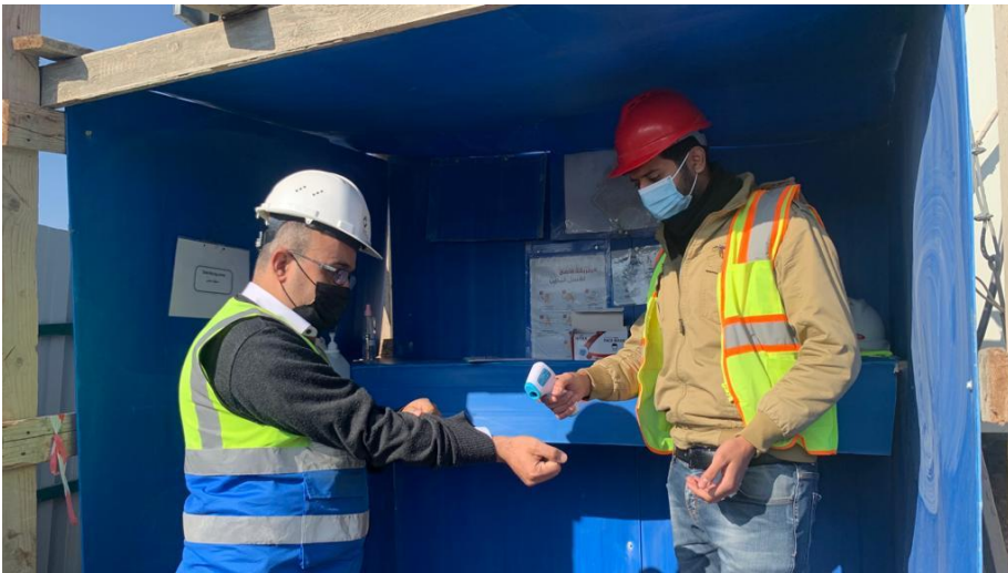
Temperature check, sterilization and signing visitors' attendance sheet at the entrance of the site, complying with Covid-19 Protocol