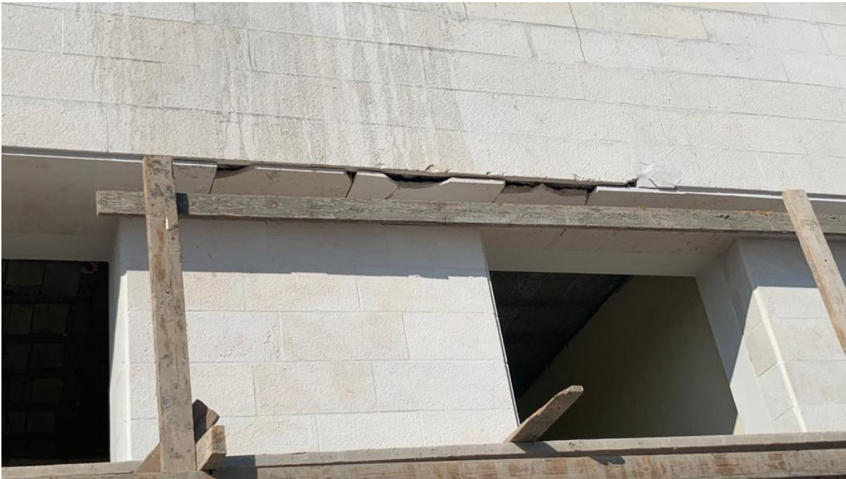
Broken stones at the facades and the Contractor was requested to replace broken pieces