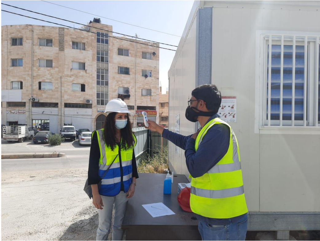
Temperature check, sterilization and signing visitors' attendance sheet at the entrance of the site, complying with Covid-19 Protocol